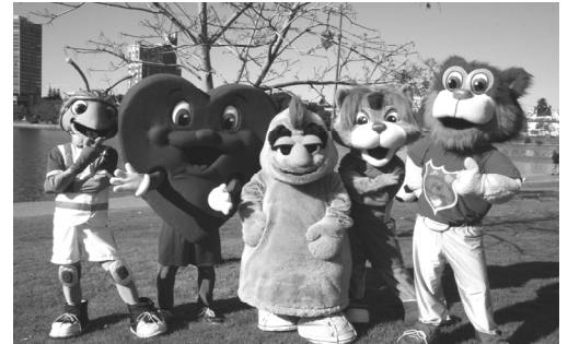
L to R: Super Weevil, Cardia Heart, Boring G. Boring, Nikki Teen, Nutri-Beast.

Health and Safety Resource Table: An informational table that can be stocked with materials about healthy eating, active living, relationship safety, smoking prevention, asthma, self-esteem, positive communication, and more.