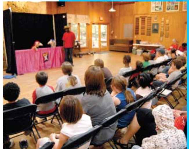
The Camp MAGIK audience watches a performance of "Uncle Gherkin's Magical Show."