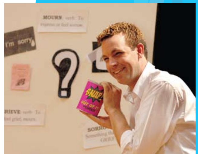
During the performance of "Fragments: Impressions of Grief," audience members learn that feeling better after grieving the loss of a loved one takes time and is not as easy as simply finding the nearest can of "Snap Out of It" Magical Grieving Powder.