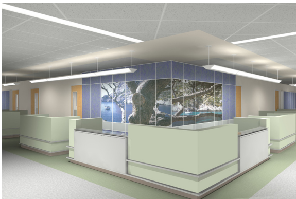
Architect's rendering of core workstation at entry to Inpatient Unit