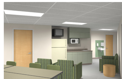
Architect's rendering of "off-stage" report room with amenities alcove in center of Inpatient Unit core