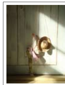
“Mexican Marionette” By Evelyn Zlomke, RN, MPH http://xnet.kp.org/permanentejournal/Fall08/marionette.html

In the first hospital environmental study to quantify how nurses spend their time, 767 nurses were randomized to two protocols at 36 hospital medical-surgical units within 17 health care systems and 15 states. Documentation consumed most nursing practice time (35.3%), followed by medication administration (17.2%), and care coordination (20.6%). Patient care activities only accounted for 19.3%.