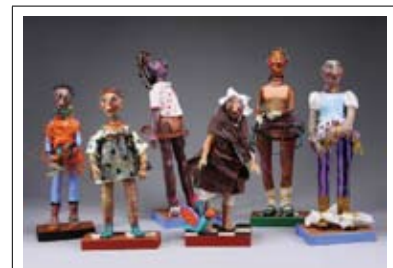
“Household Saints of Dubious Virtue” By Marsha Balian, NP http://xnet.kp.org/permanentejournal/winter09/saints.html