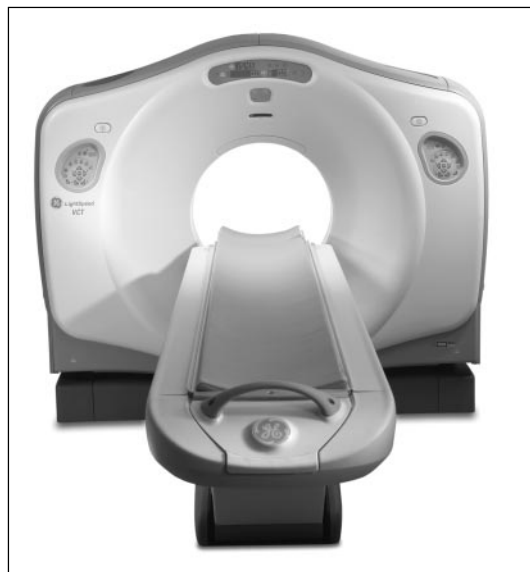
64 slice CT scanner now used for cardiac work.

Digital image acquisition has replaced film throughout the Radiology Department. Digital detectors are now used instead of film to allow immediate image review. This advance has led to an increase in image quality and a 50% decrease in imaging time. Dual-energy subtraction has allowed improved evaluation of the lungs by subtraction of the bony structures. Additional application of computer-aided diagnosis (CAD) has led to a 10% increase in tumor detection in