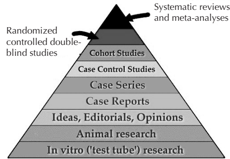
Figure 2. Diagram shows pyramidal hierarchy of evidence used by clinicians, researchers, and administrative decisionmakers to evaluate medical technology for possible use in the KP Southern California Region.

(Reproduced by permission of the publisher from: SUNY Downstate Medical Center, Medical Research Library of Brooklyn. SUNY Downstate Medical Center evidence based medicine tutorial [home page on the Internet]. [Brooklyn (NY): SUNY Downstate Medical Center]; 2005 [updated 2004 Jan 6; cited 2005 Nov 14]. Available from: http://library.downstate.edu/EBM2/contents.htm . 1