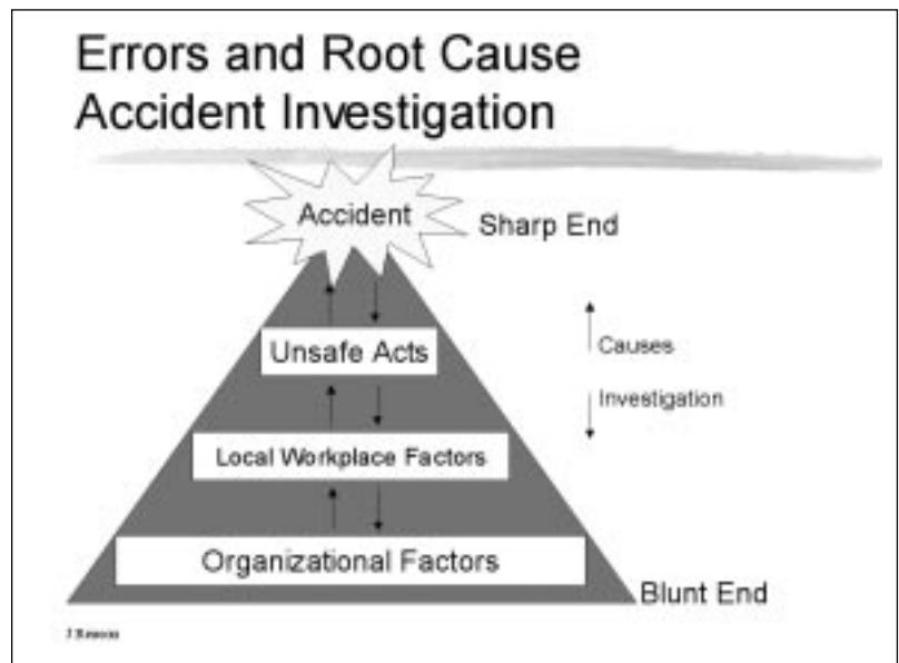
Figure 3. Adapted and reproduced by permission of the publisher and author from: Reason J. Human error. Cambridge (England); Cambridge University Press; 1997. 8:208