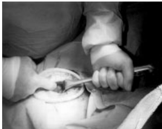
Figure 1. Photograph taken during supracervical hysterectomy shows adnexal pedicle being elevated through the minilaparotomy incision before clamping. The 5-cm incision is held open by a Mobius retractor.

Retraction force is distributed equally around the incision, and the rectus muscles are not traumatized by the overstretched metal blades of the commonly-used Balfour or O'Connor-O'Sullivan self-retaining retractors.