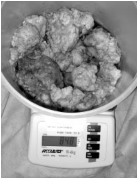
Figure 4. Photograph shows 848-g fibroid removed through a 5-cm minilaparotomy incision. (Balance shown by permission of the manufacturer, Acculab, Edgewood, New York.)

After the pedicles are clamped, cut, and tied, the uterus is amputated from the cervix and is morcellated by using a standard #10 scalpel blade (Figures 2,3). Figure 4 shows an 848-g fibroid which had been removed through a 5-cm minilaparotomy incision. Removal of this large tumor dramatically reduced the patient's abdominal profile (Figures 5,6). The largest uterus removed using this technique weighed 3250 g (more than some infants) and was removed through an 8-cm incision. Another weighed 1780 g (the size of the uterus in the 26th week of pregnancy) and was removed through a 6-cm incision. That patient was discharged from the hospital 16 hours postoperatively after undergoing a 115-minute procedure and returned to work less than two weeks later. We are compiling for possible publication our data from the last two years comparing minilaparotomy supracervical hysterectomy and standard abdominal hysterectomy. Initial results of this comparison are encouraging.