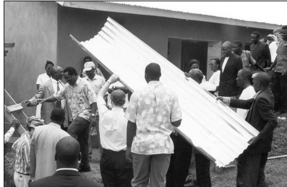
Putting the first piece of roofing on for the new hospital.

Malaria in Uganda is spread almost exclusively by a night-flying mosquito. These mosquitoes are particularly plentiful in the rainy season. In the two rainy sea-